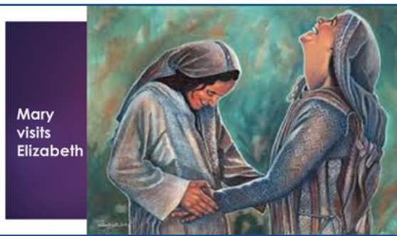
Figure 1 : PowerPoint slides from sermons about Mary