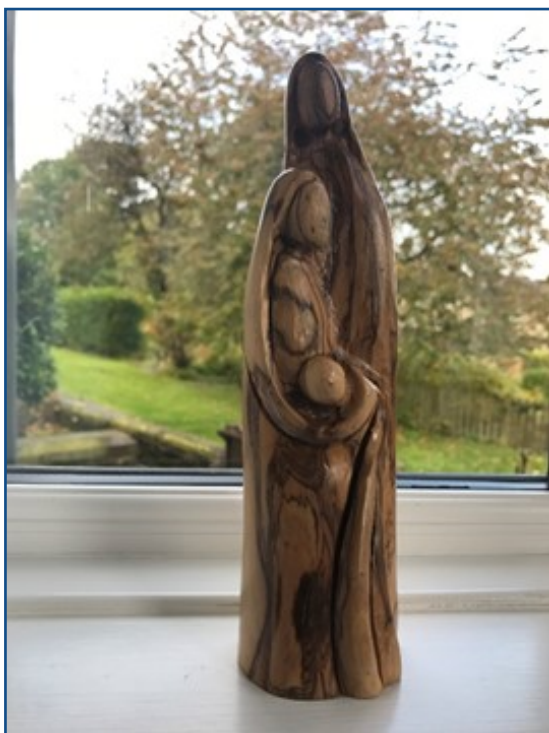
Figure 2. Mary in My Home

In the final week of my visit I was staying in a small hamlet, and I went to church on the Sunday morning, as I had done the previous week. At 10am there was due to be a service, but when I walked up to the church it was closed. Whereas the week before, the church was open before 10am, there was a priest inside, and I had participated in the service. Outside the closed church, the men of the hamlet were busy cleaning, and when I asked what was happening, they told me to come back at 6pm, when there would be a 'festa' (local