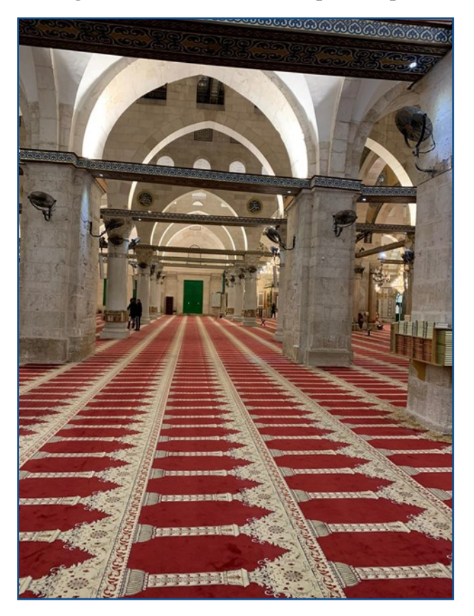
Figure 4: Inside view of Al-Aqsa Mosque