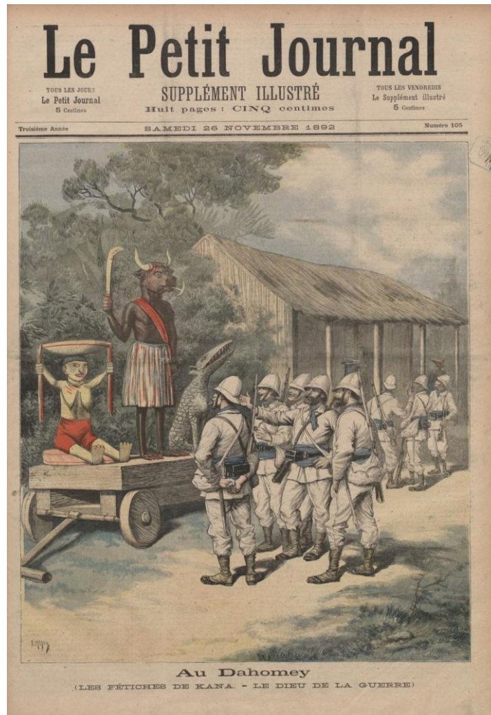
Figure 2 Front cover of Le Petit Journal, Supplément illustré , 26 November 1892.

statue a standing figure holding up a sword and with a bull's head (the 'buffalo'). 26 At the left in the background of the image the animal heads of further sculpted figures flanking the pillars of a building can be seen. The French soldiers adopt relaxed poses as they stand back and contemplate the sculptures, one gesturing towards them while another smokes a cigarette, hands behind his back.