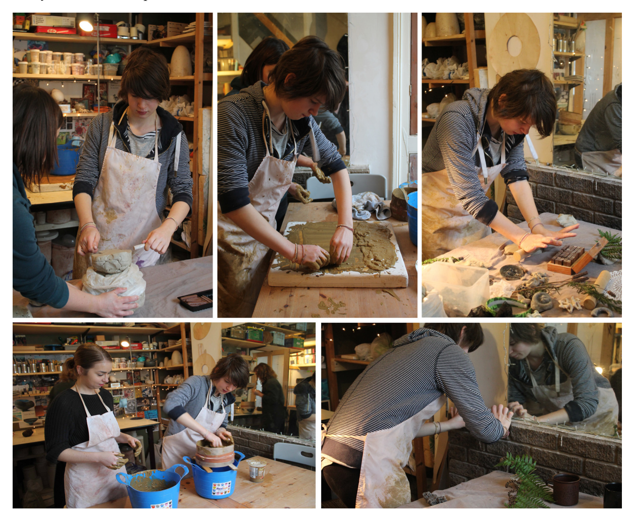
Figure 4. Proprioceptive opportunities with the clay; pulling the cheese cutter; spreading with a rubber kidney; rolling pin; pushing through a sieve; pressing into a brick texture on the wall.

Time Out. YP becomes more anxious, checking her phone frequently. The choice of a break and drink is provided. YP then decides that she would like to treat the group to biscuits from the nearby supermarket. Without warning, YP leaves. Although YP is independent enough to do this herself, for safety the tutor accompanies her.