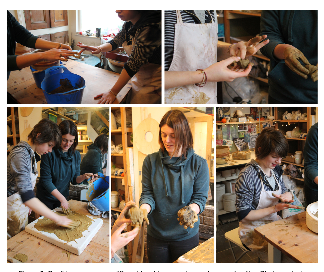
Figure 3. Confidence grows as different touching experiences become familiar.

Linking activity: A repetition of the previous task, making a pinch pot, using a more subtle, finer white clay. YP recalls and repeats the process commenting 'I get ocd with things like this, I'm liking it.' Moving forward, no preference is shown for either clay type.