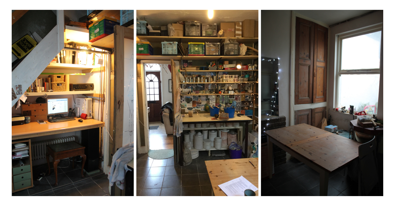
Figure 2. Computer recess; view towards 'time out' space; selected worktop.