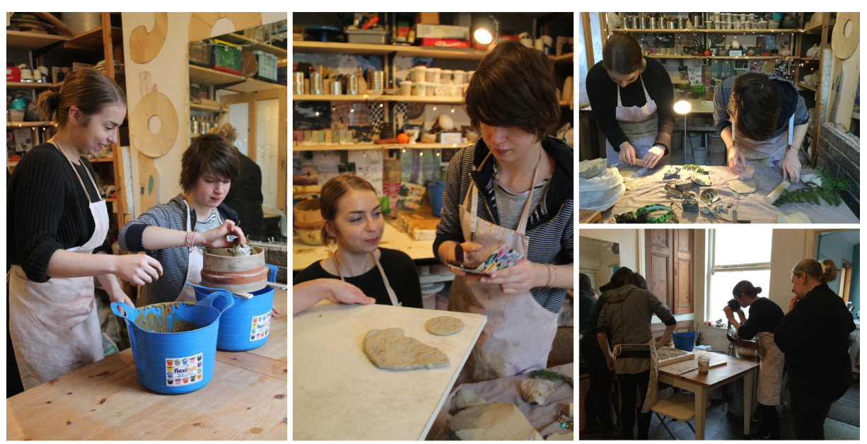
Figure 1. Intensive Interaction between student and YP; mobile phone - a mini 'time out;' task lighting from behind; student recording the activity.