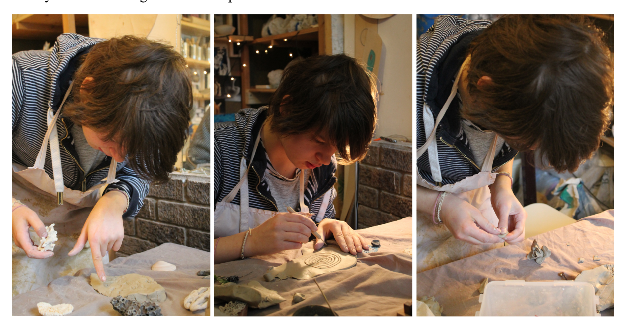
Figure 5. Fine Motor Skills and Concentration: experimenting with pressing in different textures; sketching; making a rose.

Observations of making. YP enjoys creating the rose, more than the textures, as making the leaves of the rose is instantaneous, yet forms something recognisable, an end product.<sup>37</sup> When provided with the choice of a tool rather than bare hands, the tool is always the preferred option. In answering whether working with the clay makes her feel calm, YP shares 'When I'm depressed, I might come here,' clearly communicating the session's positive effect.