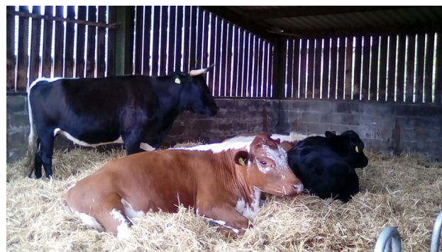
FIGURE 2 Ethan's photograph.

Many shared their appreciation of attempt by staff to acknowledge and readdress power inequalities and to