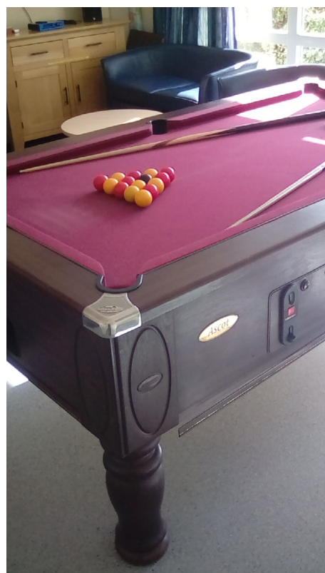
FIGURE 3 Dave's photograph.

Participants need continuous support to face challenges brought by their mental health issues, especially support connecting with others. Some observed that valued social spaces are often empty, or even locked, and this can leave service users feeling lonely and vulnerable. They receive huge benefit from supportive relationships with staff but can find it challenging when the approach to care is inconsistent between services and when there is high staff turnover and absences. Heather found this very frustrating: 'I don't like it sometimes when we get a lot of bank staff because it's