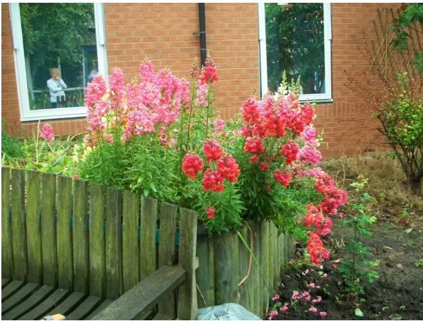
FIGURE 1 Alice's photograph.