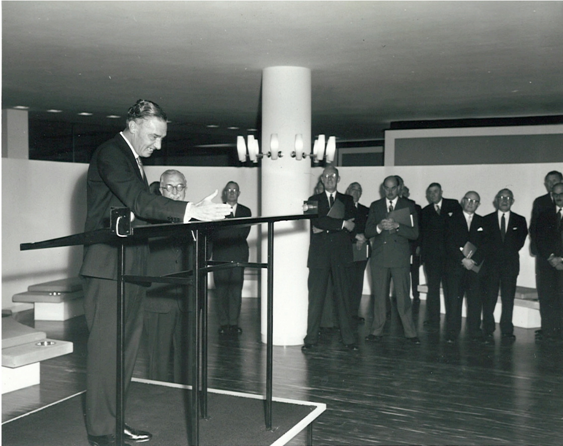
Figure 1: The Postmaster General cuts the invisible beam to officially open the centre, 1961.

Barclays also knew that the ceremony itself was just a beginning. With a suitably large and impressive reception area Barclays anticipated that the building would welcome a stream of visitors, including many representatives from the other banks, for years to come. After the opening ceremony the first of these visitors were led on a tour around the computer centre building where elements of this new data processing system were fully operational but also clearly intended for public display. Almost embarrassed by some of the indulgences made to visitors in the building's design the bank's chairman concluded by pointing towards a simpler design for future computer centres. The name given to the centre also looked towards the future; from the outset Barclays called this its No. 1 Computer Centre. 16