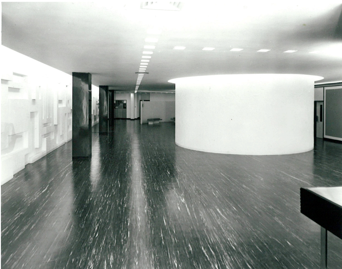
Figure 3: The spacious reception area as viewed from the entrance to the centre. The 100ft 3D Mural can be seen stretching down the left.

The opening ceremony took place in the building's cavernous reception area, a massive space framed by white walls, a black granite floor, and a white ceiling supported by simple unadorned large columns. This was the building's entry point and its most obvious statement of public display. Stretching along the length of one wall was a 100ft three-dimensional showpiece mural. The reception area (Figure 3) embodied modernist architectural concepts that were in sharp contrast to traditional classical bank architecture that symbolised stability, tradition, trustworthiness and security. 22 Even by the standards of the most recently built branches the computer centre was a thoroughly modern and even futuristic building. 23