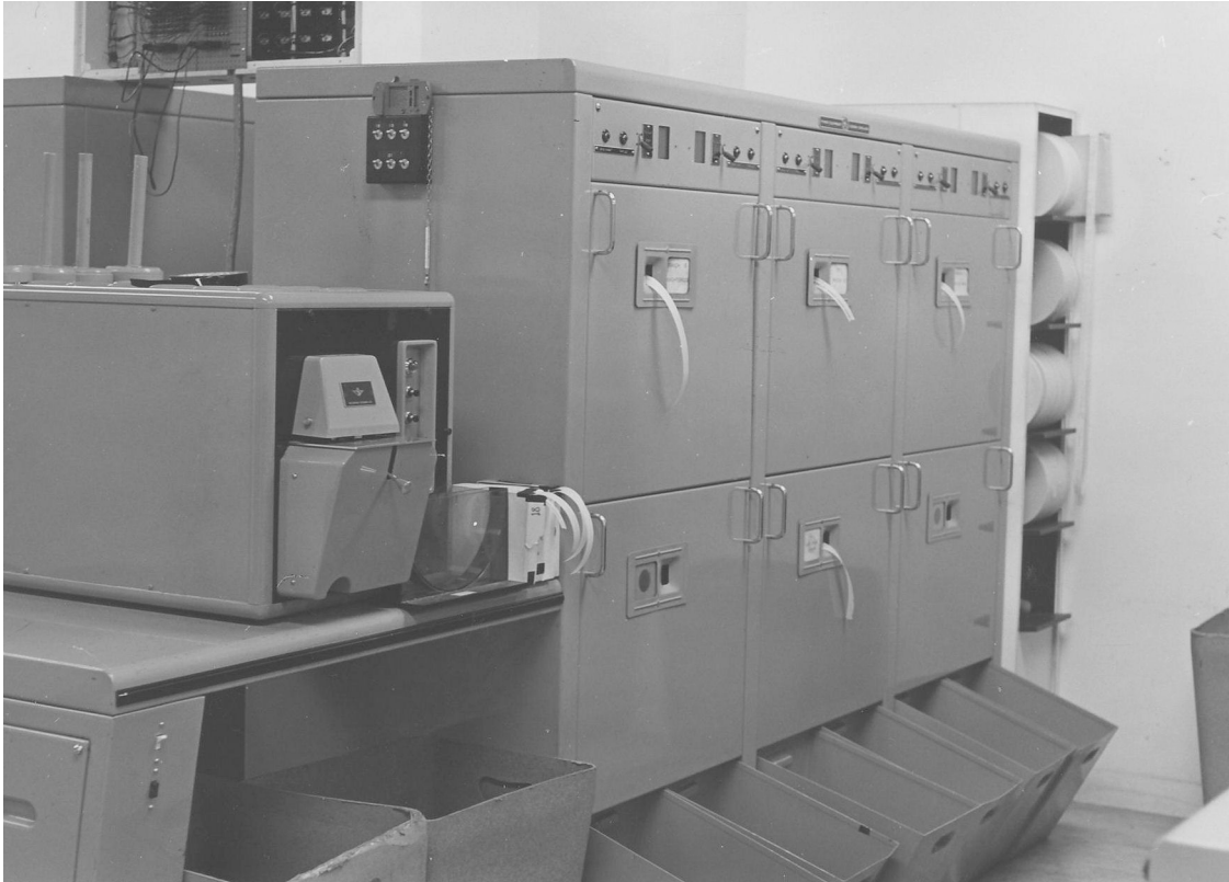
Figure 4: The communications bay showing the punches re-perforating paper tape transmissions from the branches, c. 1962.