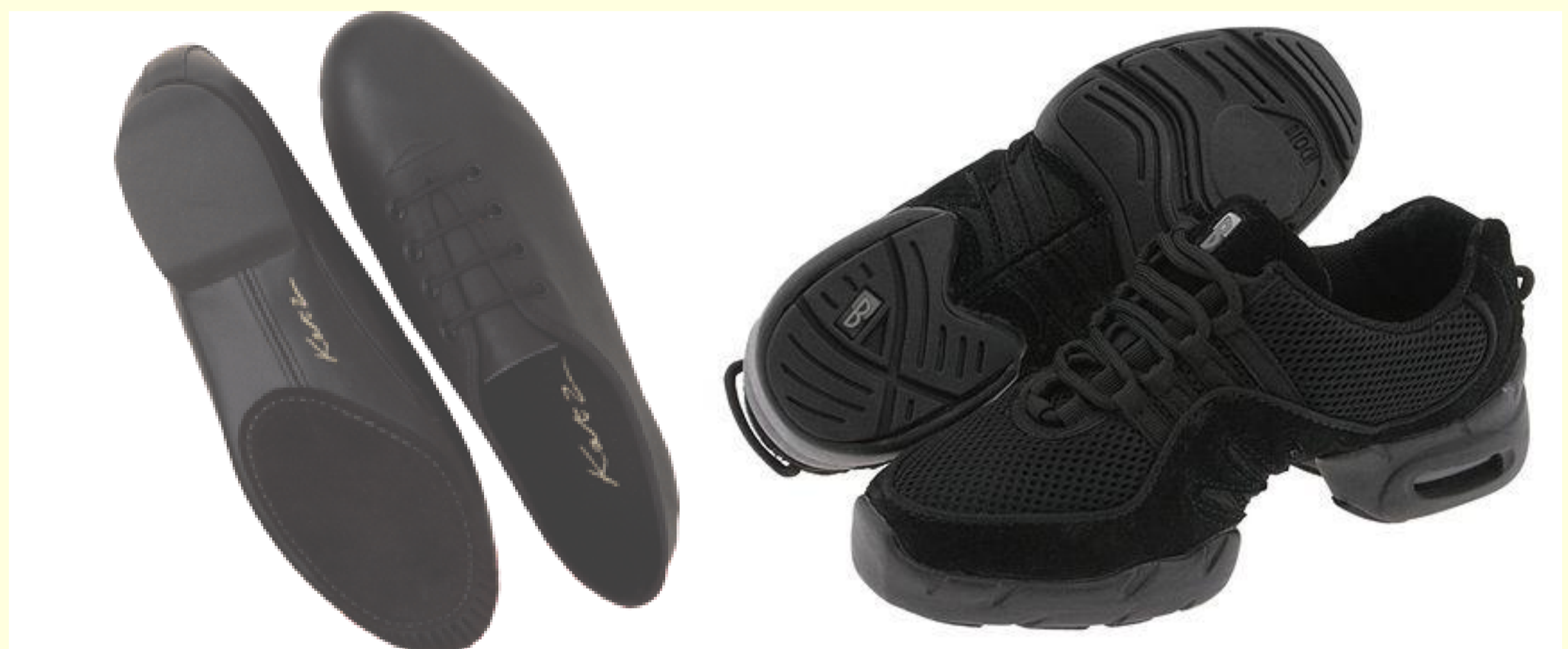
Figure 1. Katz Split-Sole Jazz Shoes (left) and Bloch Boost DRT 1 Mesh Split-Sole Dance Trainers

The study was approved by the University's ethics committee and informed consent was given by ten highly-trained female dancers (Age mean 23.1, s = 1.6 years; stature 1.64, s = .08 m; mass 57.7, s = 5.2 kg). Following test familiarisation, the participants all performed a grand jeté in three different footwear conditions: bare feet, Katz Split-Sole Jazz Shoes and Bloch Boost DRT 1 Mesh Split-Sole Dance Trainers with shock absorbing properties. The order of testing was randomised. Landing forces were recorded using a Kistler force plate (600 mm x 400 mm) sampling at 1000 Hz. Peak impact force was determined as the maximum vertical force occurring during the first 0.07 s of contact. Statistical analysis consisted of repeated measures ANOVA with post hoc pairwise comparisons using Bonferroni adjustments.