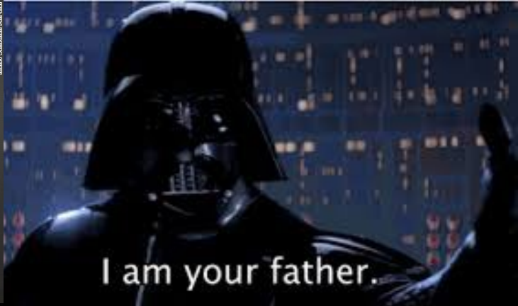
I am your father.