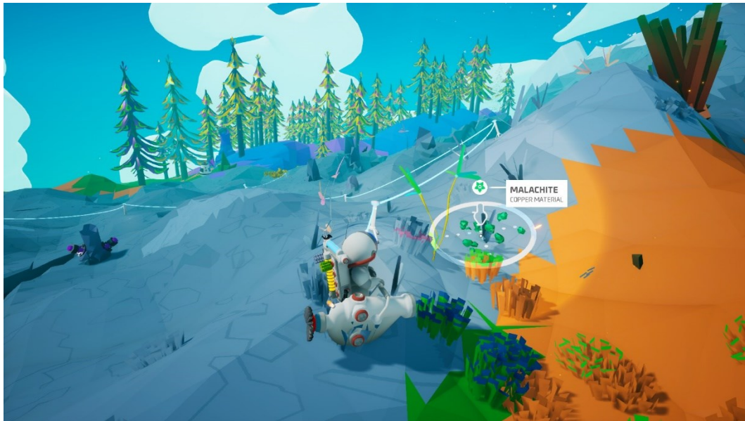
Figure 2: The “Terrain Tool” in action.