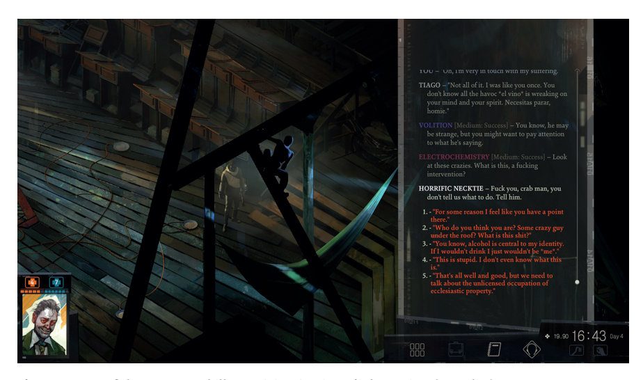
Figure 1: One of the avatar's skills participating in a dialogue in Disco Elysium.

comes of various skill checks can trigger a variety of cut-scenes and scripted sequences of events, many of which can in turn be realized in numerous different ways across different playthroughs. The resulting narrative complexity is present throughout the gameplay to an extent that the latter could be described as being primarily defined by the player's choices in terms of which of the many possible versions of the "designer story" (Rouse 2005: 204) is actualized in any given playthrough. In the following, however, we will primarily focus on two more specific aspects of Disco Elysium 's design that afford narrative agency, namely irreversible "forking path" choices within the main storyline and the skill management system that includes an unusual game mechanic called the "thought cabinet."