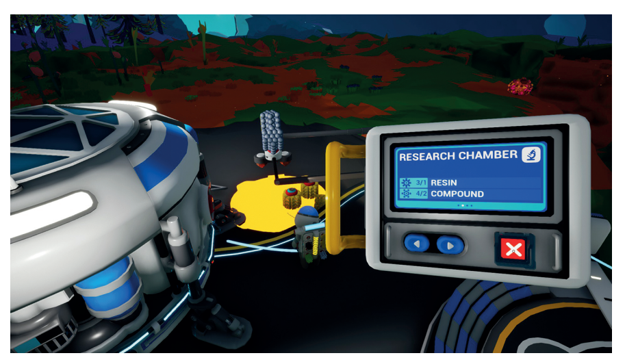
Figure 12: "Research chamber" recipe in the 3D printer in Astroneer.

What does that mean in terms of narrativity? We can think of Astroneer 's design as taking the form of "scripts" that "become apparent as technical manifestations of design decisions which not only include the set of rules of a game but also the enabling and restricting conditions of the game world and the degree of freedom provided to the users by the overall gameplay" (Abend and Beil 2015: 2). Indeed, the narrativity of Astroneer is closely connected to the "degree of freedom provided to the users," as opposed to a rigid structure that determines progression, with the use of procedurally generated game spaces and "open" game mechanics opening up a possibility space for a broad range of different "player stories" (Rouse 2005: 204) to emerge, and hence for dramatic agency to be realized via avatar action. The player and their avatar do not follow or choose one of the "forking paths" within a nonlinear narrative structure, but instead "create their own story" within the possibility space afforded by the design of the game spaces and the game mechanics. They gradually learn about planetary resources, how to mine and refine them, how to expand the base camp, and how to research new recipes to use in one of the 3D printers. As already noted above, however, the emergence of these "player stories" is supported by agency affordances in other dimensions, particularly those of spatial-explorative and configurative-constructive agency.