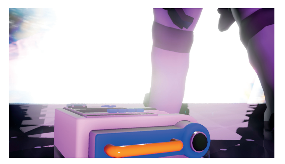
Figure 10: The optional ending cut-scene in Astroneer.

In each individual playthrough, Astroneer 's game spaces are created via a specific combination of noise-based terrain generation<sup>21</sup> and hand-crafted assets, such as