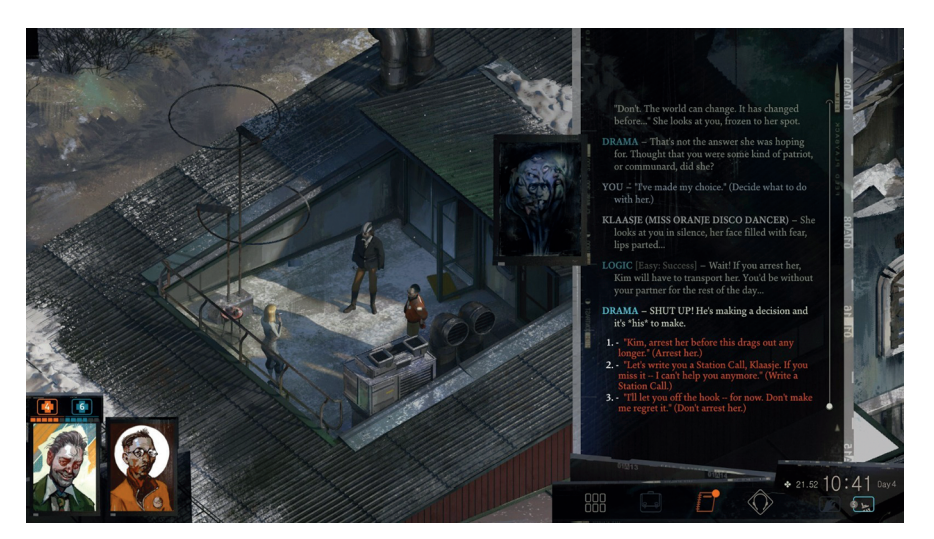
Figure 2: The player choosing Klaasje's fate in Disco Elysium.