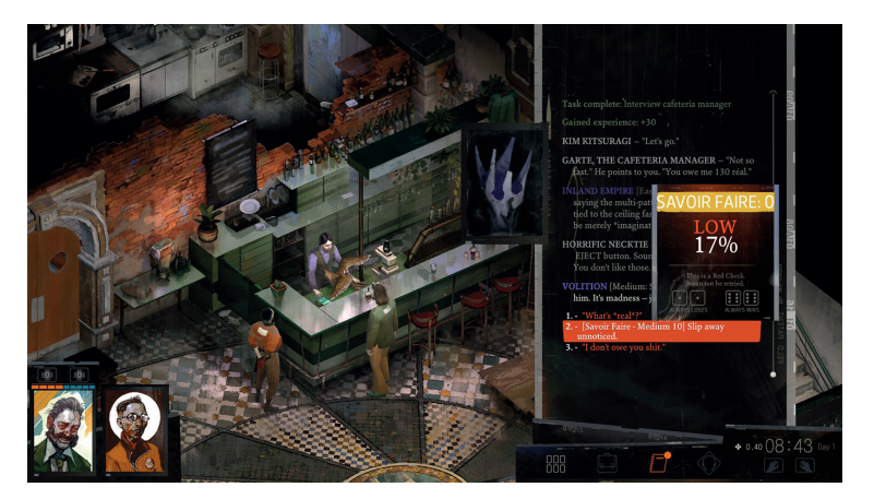
Figure 5: The avatar escaping from the yelling cafeteria manager Garte in Disco Elysium.

sense is thus not heavily penalized by Disco Elysium 's game mechanics and can in fact often lead to a richer narrative experience for the player.<sup>18</sup>