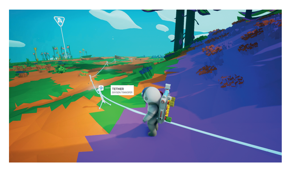
Figure 13: "Tether poles" supplying the avatar with oxygen in Astroneer .

avatar's death (see Figure 14), or the operation of certain machinery (see Figure 15), some of which (such as the avatar grabbing its throat as they run out of oxygen or automated levers on a 3D printer that is used to print one of the various recipes) will allow the attribution of at least some degree of narrativity to what would be considered primarily ludic events from a structural perspective. On the other hand, and more importantly, however, Astroneer affords dramatic agency on a bigger scale as well. If, say, the player wants to have their avatar go to a hill on the horizon, all they need to do is mine some "compound," a commonly found resource, and print "tether poles" from the printer in their "backpack," which allows them to traverse the surface with a safe supply of oxygen.