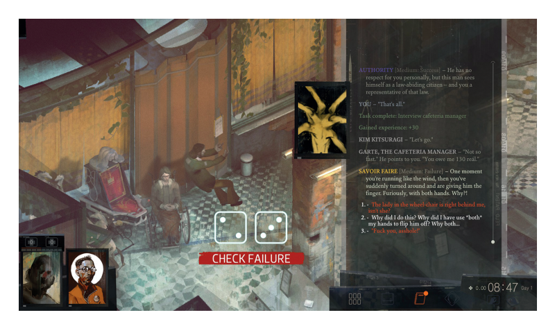
Figure 6: The avatar tripping and attempting to flip a double finger mid-air in Disco Elysium.