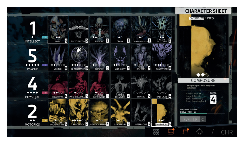
Figure 4: A possible configuration of the avatar's skills in Disco Elysium.