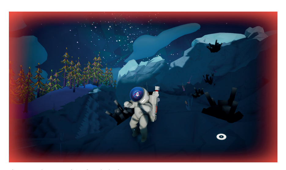
Figure 14: The avatar dying from lack of oxygen in Astroneer.