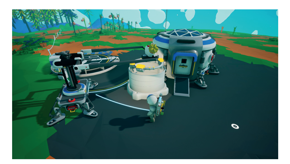
Figure 15: Automated levers on a 3D printer in Astroneer.

require "lithium" to be mined on either Vesania or Novus, and so forth. In this way, Astroneer 's production lines create the possibility space for "eventful" avatar action. As noted above, interplanetary travel in pursuit of rare resources brings new challenges, which in turn require the player's successful engagement with other game mechanics within the resource management system, resulting in the potential for thrilling adventures. At the same time, the construction of, say, a