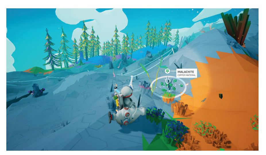
Figure 11: The avatar using the "terrain tool" in Astroneer.