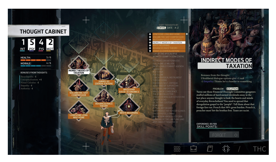
Figure 8: The simultaneous "internalization" of communist and capitalist "thoughts" in Disco Elysium .

able for internalization after having opted for a minimum of four left-leaning dialogue options that align with communist values. However, there are no restrictions in the design that would stop the simultaneous internalization of a capitalist "thought" such as "indirect modes of taxation," which is made available upon repeated selection of capitalist dialogue options, the bribing of certain officials, etc. (see Figure 8). While Disco Elysium 's skill management system is closely connected to its nonlinear narrative structure, it is worth noting that the resulting choices are still best described as affording narrative rather than dramatic agency to the player: The complexity of the "forking paths" that Disco Elysium 's nonlinear narrative structure and its narratively inflected skill management system generate means that the player will never get to see more than a fraction of the possible ways in which their avatar's story can unfold, but that does not change the fact that all of these "forking paths" are fundamentally predetermined. This is notably different in our second case study, the design of which focuses less on affording narrative agency than it does on affording dramatic agency.