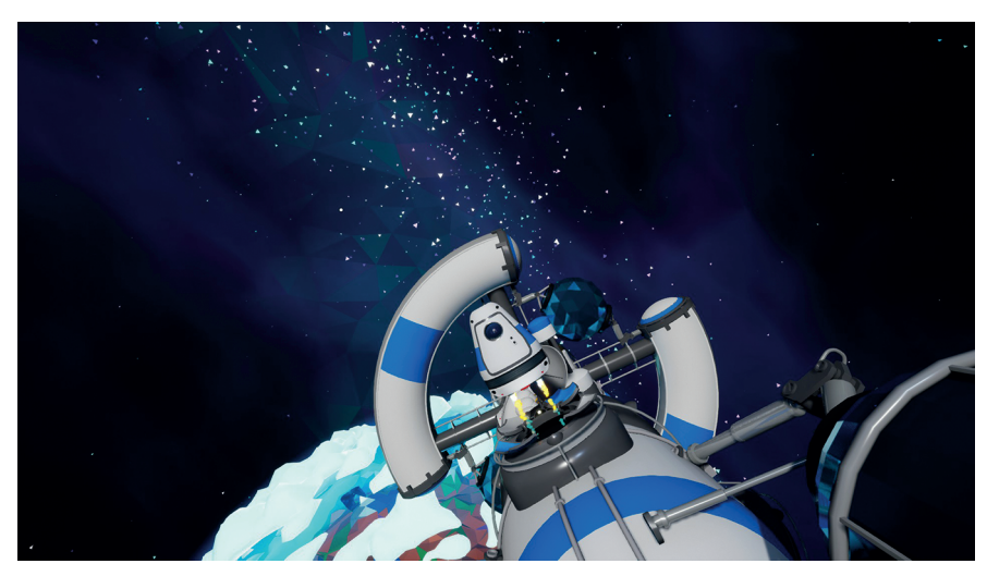
Figure 9: The initial cut-scene-like scripted sequence in Astroneer.