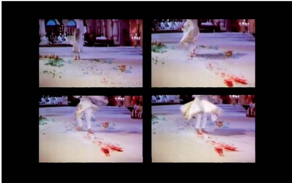
Figure 5. A sequence from Pakeezah (Amrohi, 1971) is presented in split screen.