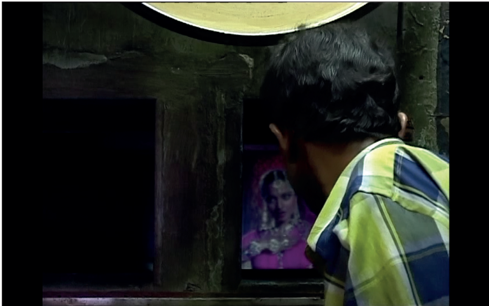
Figure 4. A sequence from Muqaddar Ka Sikandar (1978) seen via the projectionist's viewing window.

Alongside this footage, intertextual elements keep the interplay between the real and imagined, the actual and the performed, to the forefront of Dutta's examination of bar dancers' experiences. Interviews with individual women are framed by brief segments from two 1970s 'courtesan' films. The first, appearing before the interviews, is from the hugely popular Muqaddar Ka Sikandar (1978) and features the actor Rekha as a courtesan performing in front of a male audience. Music from the film plays extra-diegetically as a rain-soaked Manto walks along a dark street and then sits on a bench, drinking and reciting Urdu poetry. We observe the clip of Rekha dancing itself through a projectionist's viewing window, over their shoulder as it plays in a cinema (Figure 4), before Dutta expands the view of the screen in the auditorium to the full screen, with the music now diegetic. As we move between this screen back to Manto and then to a dancer in a contemporary Mumbai bar, the music from Muqaddar Ka Sikandar continues to play, shifting from extra-diegetic to diegetic again. The second clip, immediately following the last interview, features the song and dance sequence 'Teer-e-Nazar' ('I shall see arrows from