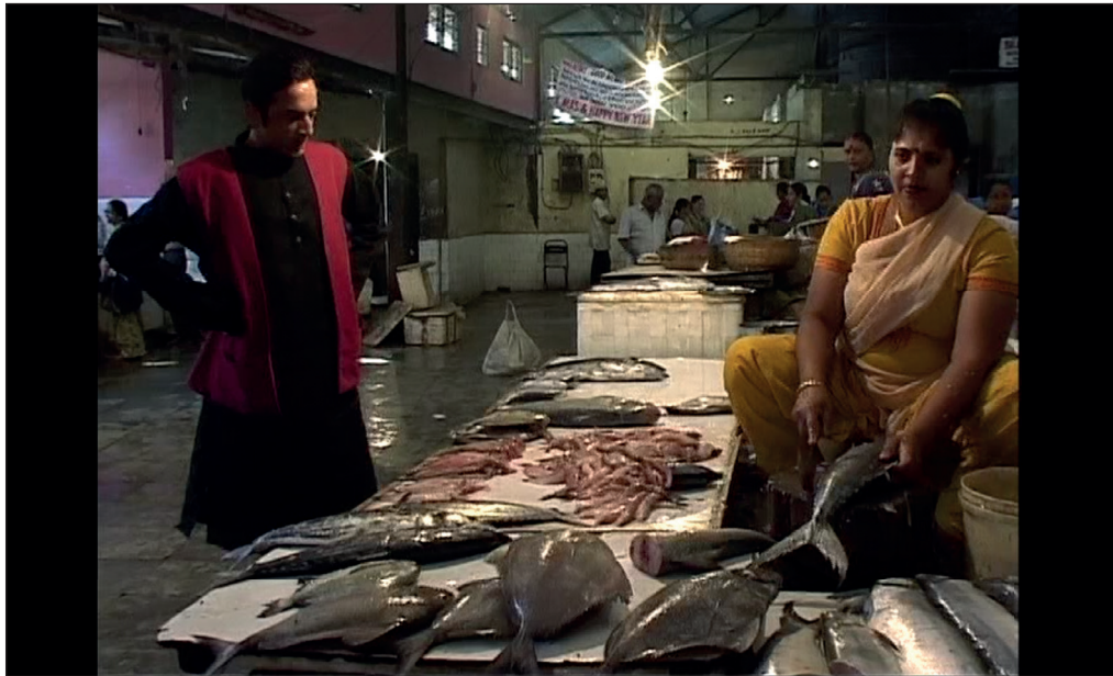
Figure 2. Manto visits the fishmarket, unseen or unacknowledged by the woman preparing her produce.