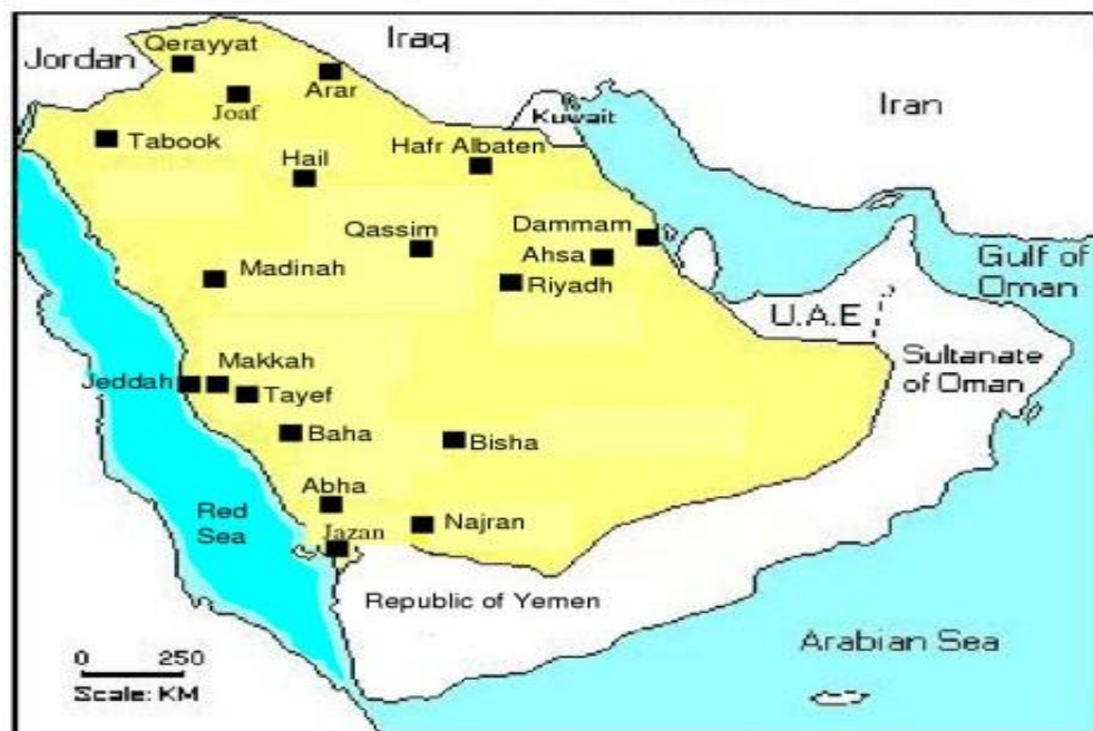
Figure 1. Map of Saudi Arabia

technologies in Saudi Arabia. SmartSurvey was selected as a tool to collect online data. The number of samples collected for the survey was 1,506. The samples took from people aged 16 years and above and their gender distribution was match demographic data held about fans in the KSA.