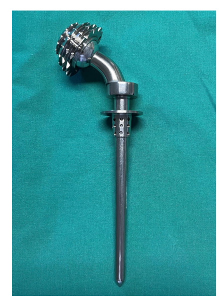
Fig. 1 ▲ A Sivash metal-on-metal prosthesis, developed by Prof. Konstantin M. Sivash in 1956

implant with cobalt-chromium head and acetabular liner with titanium shell and stem ( D Fig. 1; [5]). It was designed as a monoblock-constrained device with the head permanently fixed to the stem neck and a constraining ring [5].