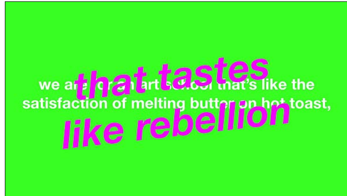
Figure 2 – Video still from the Toma Manifesto-In-The-Making (2018)