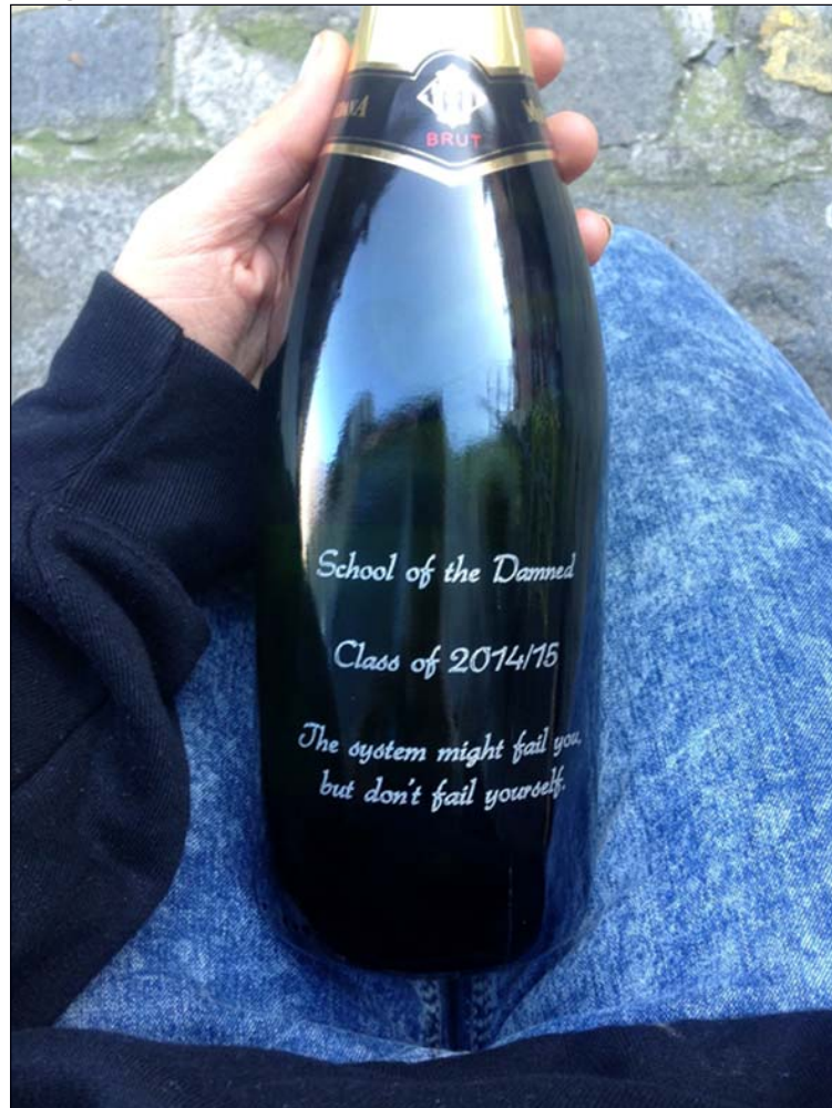
Figure 4 – School of the Damned Graduation Cava (2014)

into homo-oeconomicus (Brown, 2015). Whilst more work needs to be done to align these emergent radical models with the epistemologies of the South, hopefully the act of mapping their polyphonic voices within this paper begins the process of forming the critical alliance between defenders of the pursuit of knowledge without market value' and the 'defenders of postabyssal science' which Santos recognises as the precondition of the pluriversity (Santos 2018, p. 278).